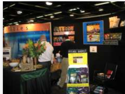
Above: Village Harvest booth Expo West 2009 Below: Post-show lobby

As the first official launch of the line of frozen whole grains, attendees were impressed by the quality and versatility of the product. A product which is brand new to both the supermarket and food service industries, show goers enjoyed delicious recipes prepared by our very own in-house chef.