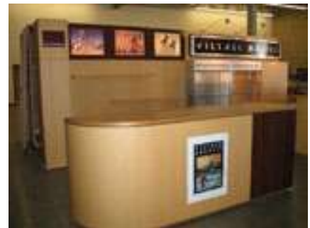
New freezer-equipped booth