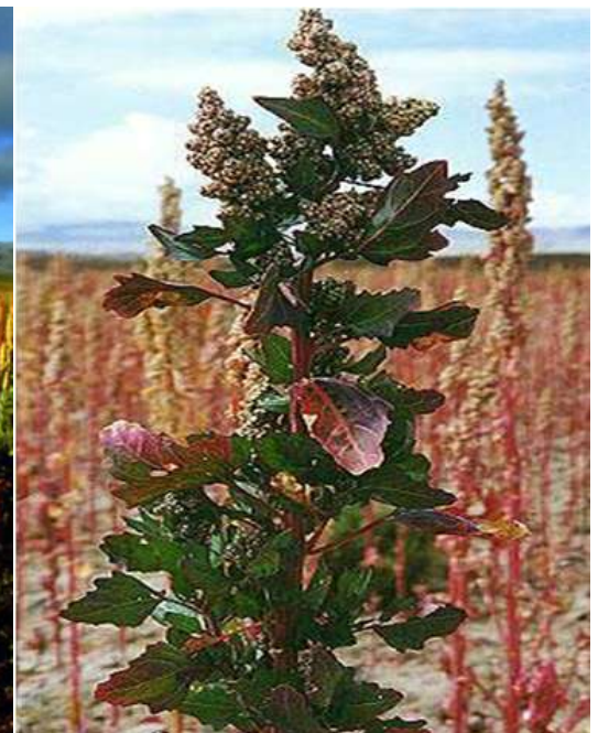
The Quinoa Plant