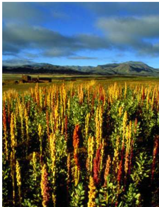
Quinoa Fields of Bolivia