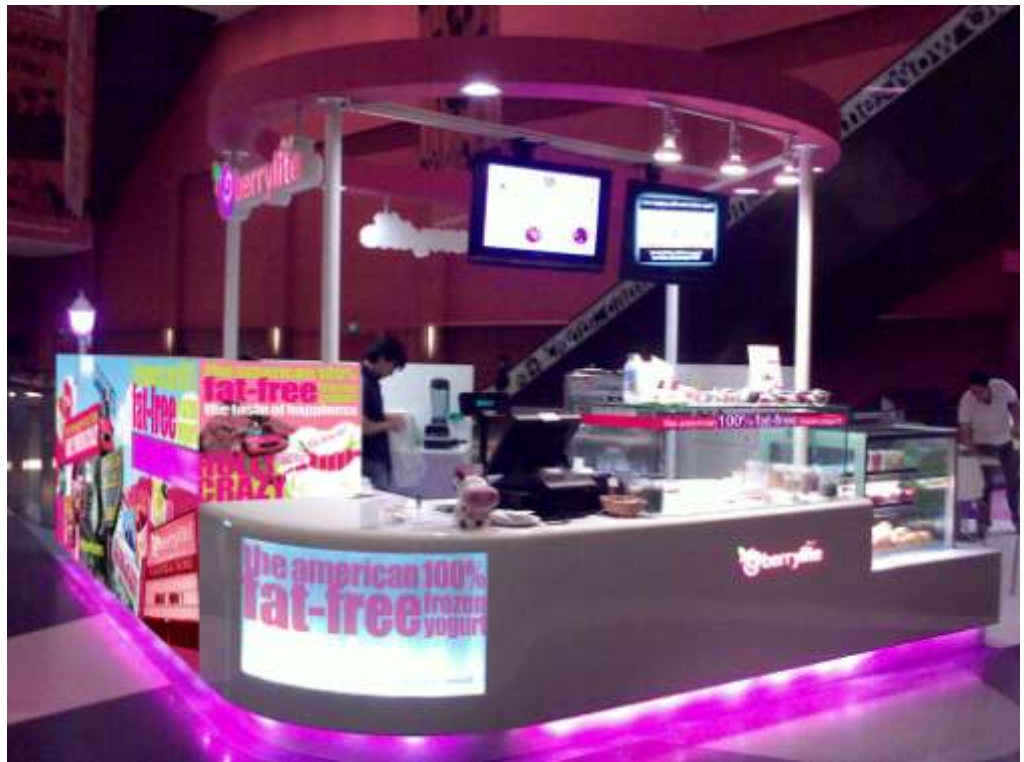
Berrylite Frozen Yogurt Stand - Singapore