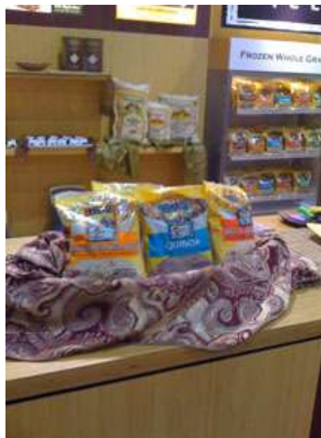
Village Frozen Rice on Display

Village Harvest Rice enjoyed the busiest Natural Foods Expo West Food Show ever – the show kept us hopping! Our booth looked great. Our location had room for the constant stream of hungry show-goers, eager to enjoy the delicious whole grain dishes prepared by our chef, Desiree. We had visits from many important nationwide buyers and local independents alike. We also created a lot of buzz with several representatives from publications interested in our awesome line of fully-cooked frozen whole grains. All in all, Expo West 2010 was a success!