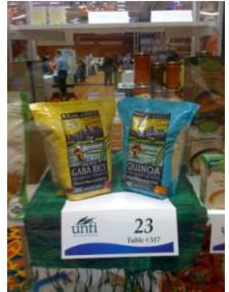
New Thai Sprouted Brown Rice and Bolivian Quinoa at Table 517